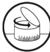
Ballistic Drop Compensation (optional)