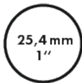
Main tube 25.4 mm