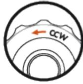
Adjustment direction CCW