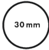
Main tube 30 mm