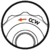
Adjustment direction CCW